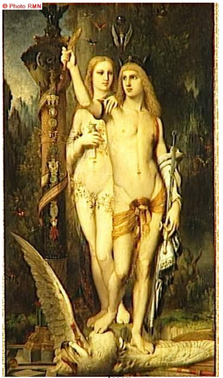
Jason by Gustave Moreau (1865)

Oil on canvas, 204 x 115.5 cm, Musée d'Orsay, Paris.